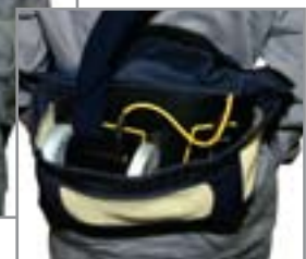
Back View - open mesh bag

NOTE: Units provided with standard U.S. two prong blade electrical plugs. The plugs are for use in North and Central America and Japan. For all other requirements, please contact Salisbury International Customer Service.