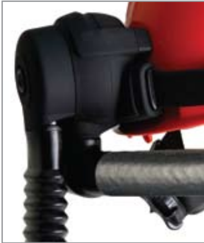
Intake hose attaches to the blower unit with a bendable joint to allow easy movement.