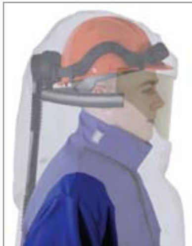
Use this unit with Salisbury Arc Flash Protective PRO-HOODs.

◀ SALISBURY'S PRO-AIR ACAIR2000 - NEW UPGRADED CIRCUIT BOARD AND BATTERY Salisbury's PRO-AIR ACAIR2000 system is designed to blow forced ambient air through a single intake hose, providing fresh oxygen to the worker and reducing the hazardous effects of shield fogging. The unit is microprocessor controlled and operates automatically by blowing air continuously for over three hours on one charge. On the back of the unit is a button that pauses the continuous flow, if needed. Use this unit with Salisbury's PRO-HOOD® and PRO-WEAR® arc flash protection clothing.